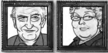
George = Alice

Look at the family. Complete the crossword.